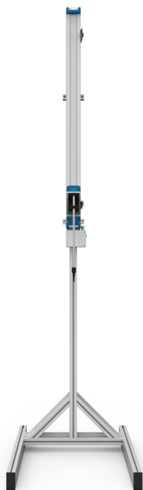
Single Vessel Extra Large