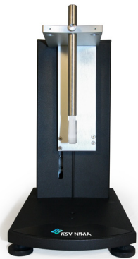
Single Vessel Small