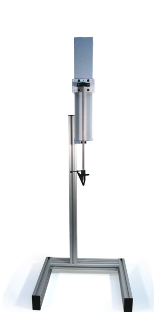
Single Vessel Medium/Large