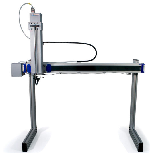
Multi Vessel Medium/Large